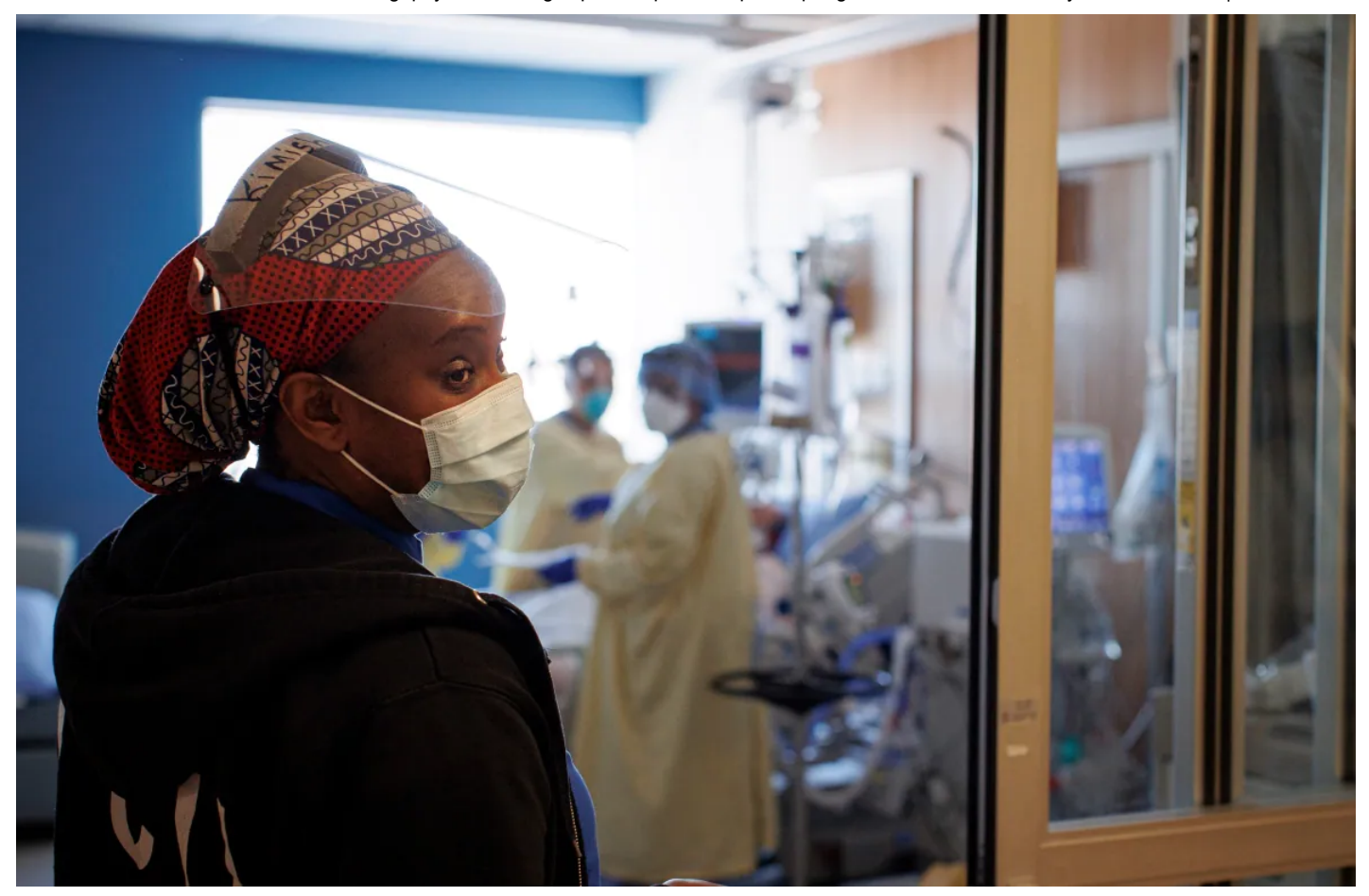
Hospitals across Ontario have been short-staffed, leading to emergency rooms closing for hours or days at a time.

Since only a "small number" of residency positions are accessible to internationally trained physicians, the college says the province is "essentially limiting" the opportunity to grow the base of future doctors and support internationally educated physicians.